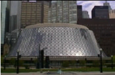
Roy Thompson Hall