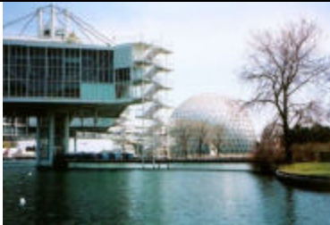
Cinesphere at Ontario Place